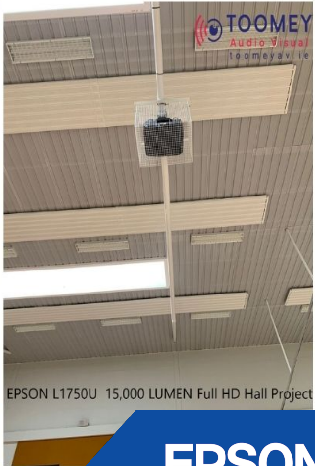
EPSON L1750U 15,000 LUMEN Full HD Hall Project